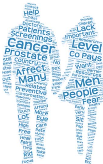
Figure 6. Community voices - cancer