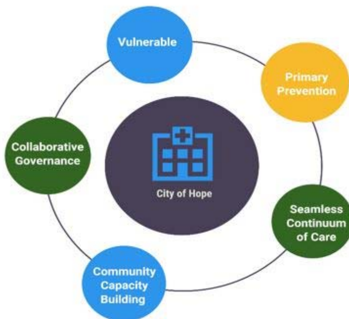
Figure 7. Five core principles