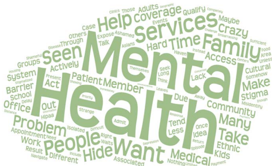
Figure 5. Community voices on mental health

Our community members and our CBAC have spoken: It is time to address the ways that mental health impacts our ability to fight chronic disease and cancer. They have indicated that mental health issues are oftentimes the underlying factor that prevents someone from achieving good health. We cannot expect to make sustainable behavior changes without addressing the mental health issues that prevent a person from changing his or her behavior. Many of the lifestyle risk factors that cause diabetes and cancer are modifiable. How can we provide the support necessary for someone to make behavior changes that will reduce their risk for cancer and other chronic conditions? Does City of Hope have the capacity to do this? Are there other ways to leverage our expertise to help the broader community increase access to mental health services that are culturally and linguistically appropriate?